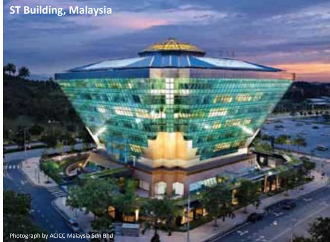
ST Building, Malaysia