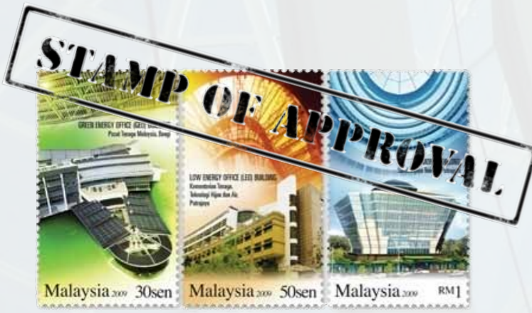
Green Building Stamp Series All buildings by Strategic Green Alliance